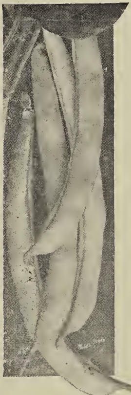
Red Valentine Beans